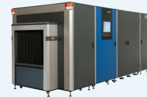
HI-SCAN 10080 XCT