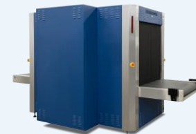
SDX 100100 DV SDX 100100