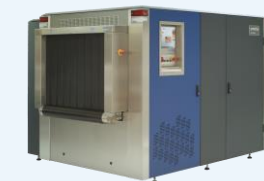
HI-SCAN 10080 EDX-2is